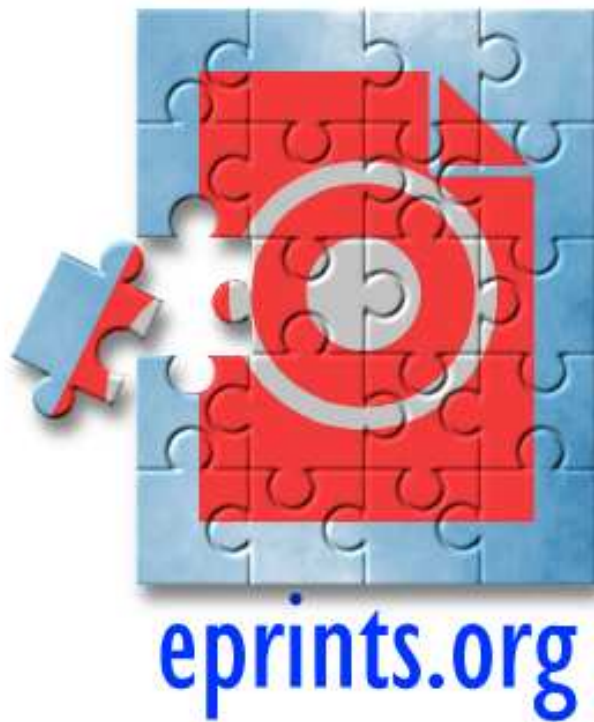
Figure 16.1: EPrints Logo