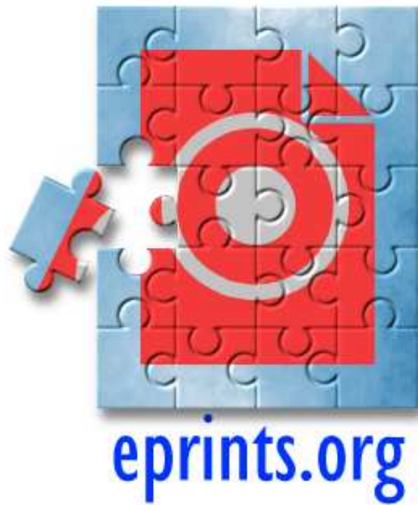
Figure 16.1: EPrints Logo